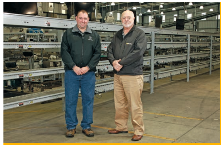
FloStor worked with Prima Frutta to package millions of cherries without going bananas.

In short, we do everything possible to make sure you're 100% satisfied with every FloStor project.